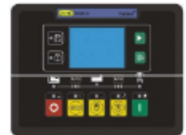
(2) GU641B out auto-switching