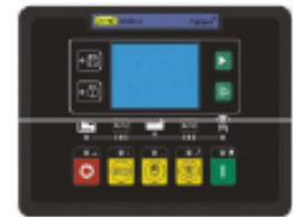
(2) GU641B out auto-switching