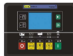
(2) GU641B out auto-switching